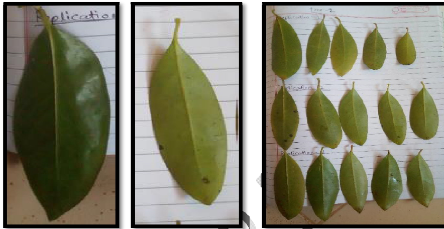
Pic. Leaf selected to analyse for shape, colour and other parameter.