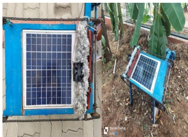
fig.3 Comparison of dusted solar panel VS cleaned solar panel