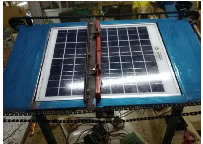
fig.2 Solar Panel Tracking System Prototype with Mechanical Movement Mechanism

This path is indicated by the broken arrows. Waveforms (3) and (4) can be observed across D2 and D4. The current flow through RL is always in the same direction. In flowing through RL this current develops a voltage corresponding to that shown waveform (5).