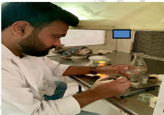
Picture 1. Laboratory analysis