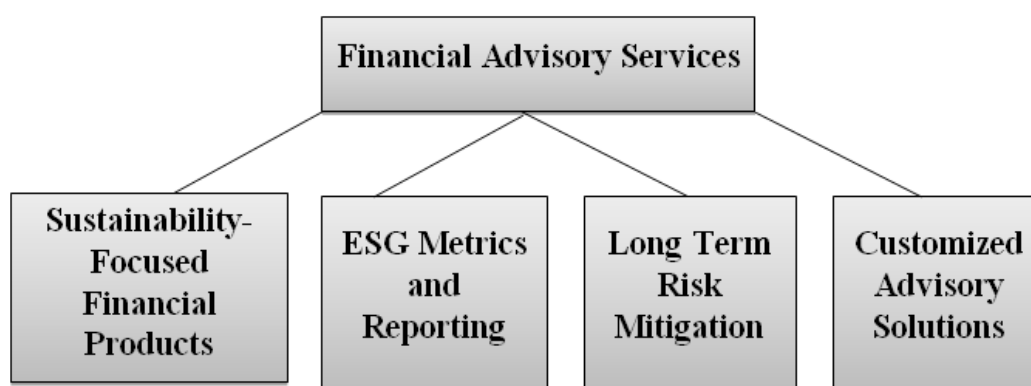
Figure 2: Financial Advisory Services role in promoting corporate sustainability in the U.S Market.

The findings of this review highlight a substantial amount of evidence regarding the critical role that financial advisory services play in promoting corporate sustainability in the U.S. market. From the 25 studies analyzed, which were published between 2019 and 2024, four main themes emerged (See figure 2): Sustainability-Focused Financial Products, ESG Metrics and Reporting, Long-Term Risk Mitigation Strategies, and Customized Advisory Solutions.