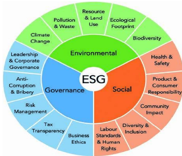
Figure 4: ESG Metrics and Reporting Analysis.