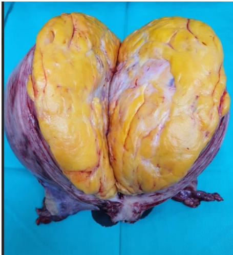
Figure 2: Cut section of intramural firm fibro-fatty mass

Histopathology examination revealed uterine lipoleiomyoma. The intramural mass is composed of mainly mature fat cells without nuclear atypia mixed with bland, spindle-shaped smooth muscle cells in a whorled pattern. The rest of the study was normal.