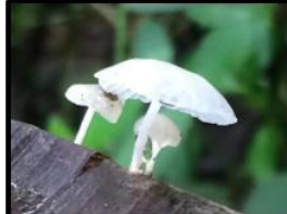
Plate 34. Delicatula integrella (Pers.) Fayod

Con formato: Sangría: Primera línea: 4.5 car.