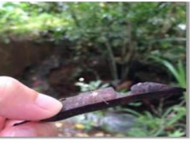
Plate 16. Mycena adscendens (Lasch) Maas Geest.