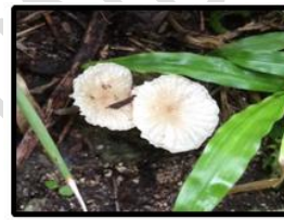
Plate 14. Marasmius calhouniae Singer