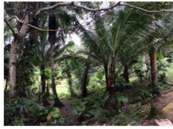
Plate 44- Barangay Bonifacio, Allen, Northern Samar