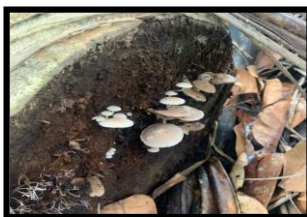
Plate 20. Parasola plicatilis (Curtis)