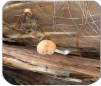
Plate 1. Agrocybe pediades (Fr.) Fayed

Comentado [A15]: Please, remove authors from the species. It would be better if the authors made the figures of nine photographs, so that they would look better and take up less space.