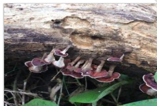
Plate 23. Stereum ostrea (Blume & T. Need ex Fr.)