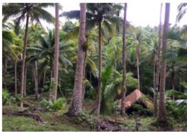
Plate 43- Barangay Alejandro, Allen, Northern Samar