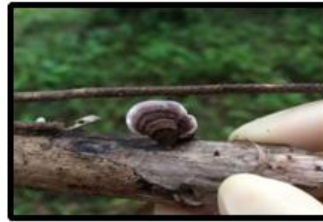
Plate 38. Ganoderma tropicum (Jungk.) Bres