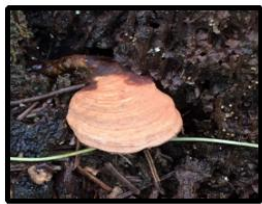
Plate 11. Fomes fomentarius L.:Fr.