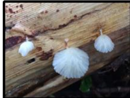
Plate 33. Hemimycena mauretani