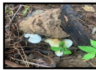
Plate 19. Omphalotus nidiformis (Berk.) O. K. Mill