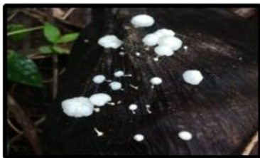
Plate 37. Clitocybe dealbata (Sowerby) Gillet