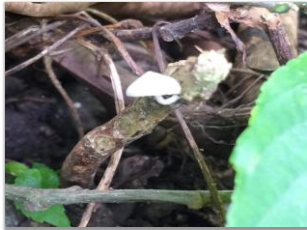
Plate 17. Mycena galopus (Pers.) P. Kumm