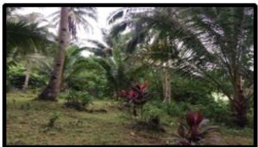
Plate 41- Barangay Lipata, Allen, Northern Samar