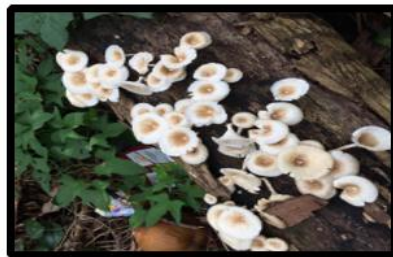
Plate 4. Clitocybula abundans (Peck) Singer