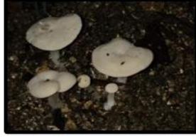
Plate 30. Clitocybe rivulosa (Pers.) P. Kumm.