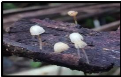
Plate 7. Coprinellus disseminatus (Pers.) J.E. Lange