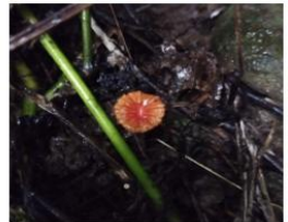
Plate 12. Laccaria tortilis (Bolton) Cooke