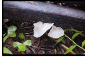
Plate 31. Sistotrema confluens Pers.