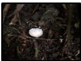
Plate 13. Macrolepiota procera (Scop.) Singer