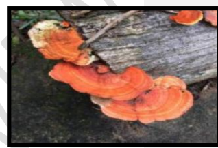
Plate 22. Pycnoporus sanguines (L.) Murrill