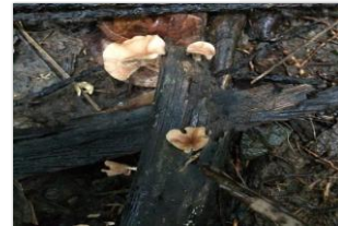
Plate 25. Trogian infundibuliformis Berk & Broome