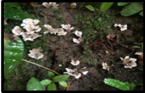
Plate 5. Chondrostereum purpureum (Pers.) Pouzar