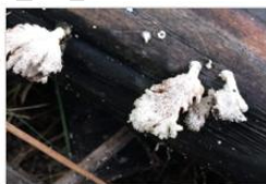
Plate 26. Schizophyllum commune Fr.