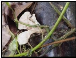
Plate 32. Muscinupta laevis (Fr.) Redhead, Lucking & Lawrey