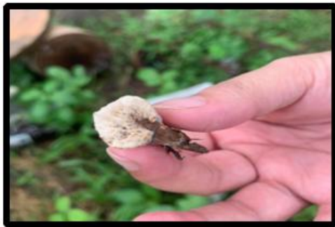
Plate 6. Clavulina coralloides (L.) J. Schrot.