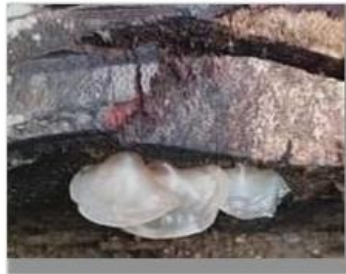
Plate 2. Auricularia auricula-judae (Bull.) J. Schrot

Comentado [A15]: Please, remove authors from the species. It would be better if the authors made the figures of nine photographs, so that they would look better and take up less space.