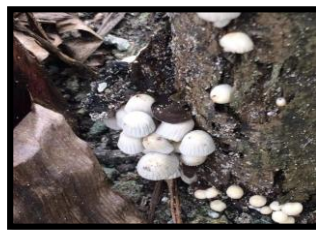
Plate 18. Mycena leptcephala (Pers.) Gillet