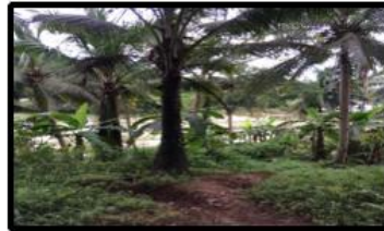
Plate 40- Barangay Jubasan, Allen, Northern Samar