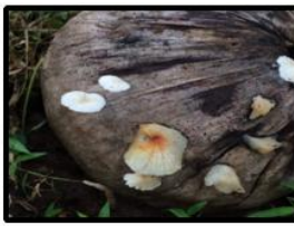
Plate 15. Marasmius rotula (Scop.) Fr