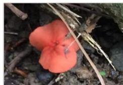
Plate 28. Cantharellus cinnabarinus (Schwein.) Schwein