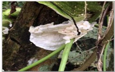
Plate 3. Auricularia mesenterica (Dicks.) Pers.