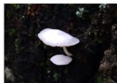
Plate 27. Marasmius delectans Morgan