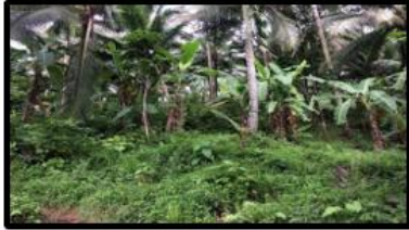
Plate 39- Barangay Victoria, Allen, Northern Samar