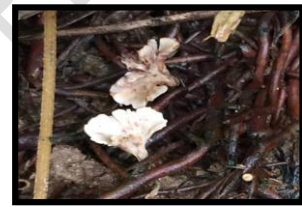
Plate 24. Thelephora vialis (Schwein.)