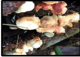
Plate 29. Leratiomyces ceras (Cooke & Massee) Spooner & Bridge