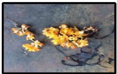
Plate 9. Dacrymyces chrysospermus Berk. & M. A. Curtis