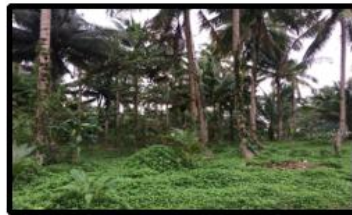
Plate 42- Barangay Cabacungan, Allen, Northern Samar