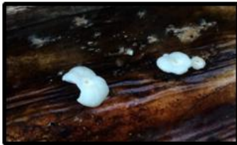
Plate 35. Favolus acervatus (Lloyd.) Sotome & Hatt

Con formato: Sangría: Primera línea: 4.5 car.