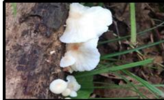
Plate 36. Clitocybe robusta