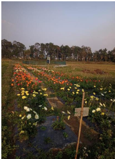
Fig 1. General view of the experiment

Kanwar (2018) reported that foliar spray of urea, zinc and kinetin has significant impact on plant growth parameters of wheat and also compensates the damage cause by cereal cyst nematode as compared to that of untreated control.