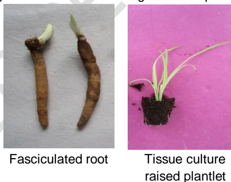
Figure 2: Planting materials used in the experiment

The planting materials used in the experiment comprised of conventional planting materials (CPM) i.e. fasciculated root and tissue culture raised plantlets (TCRP) (Figure 2). Uniform sizes of single sprouted fasciculated root were selected as CPM. Meanwhile, 30-35 days old secondary hardened tissue culture raised plantlets were used in the experiment. All the planting materials were planted with the spacing of 30 x 10 cm during 1 st fortnight of July in all the experimental years and it was harvested in 1 st fortnight of March (240-250 DATP). Normal agronomical practices were followed during the crop growth period. The experiment was laid out in completely randomized block design with 8 repetitions.