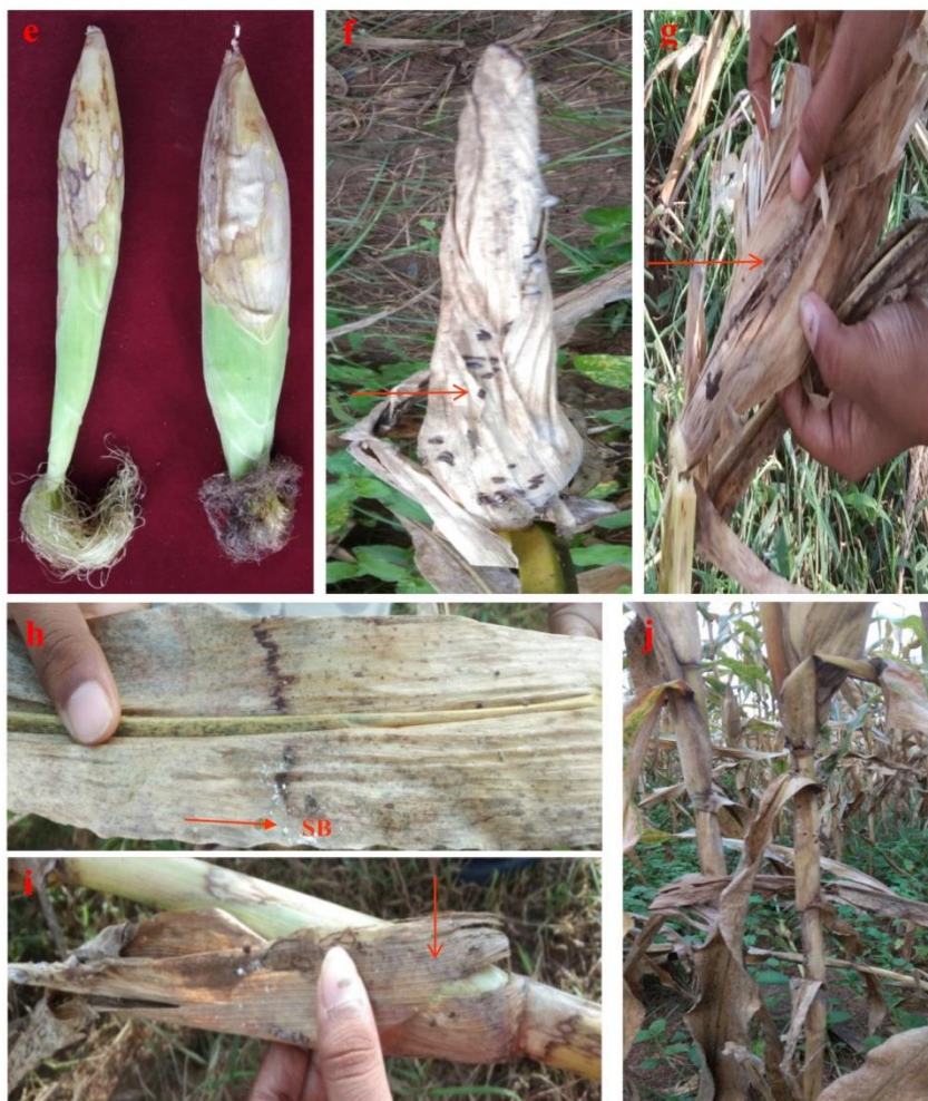
Plate 3. Symptoms of BLSB on maize under field conditions: e-BLSB symptoms on outermost husk leaves; f-Sclerotial bodies on the cob; g-Shredding of husk leaves; h- Shredding of husk leaves; i- Stalk breakage; j-Severely infected plants with BLSB