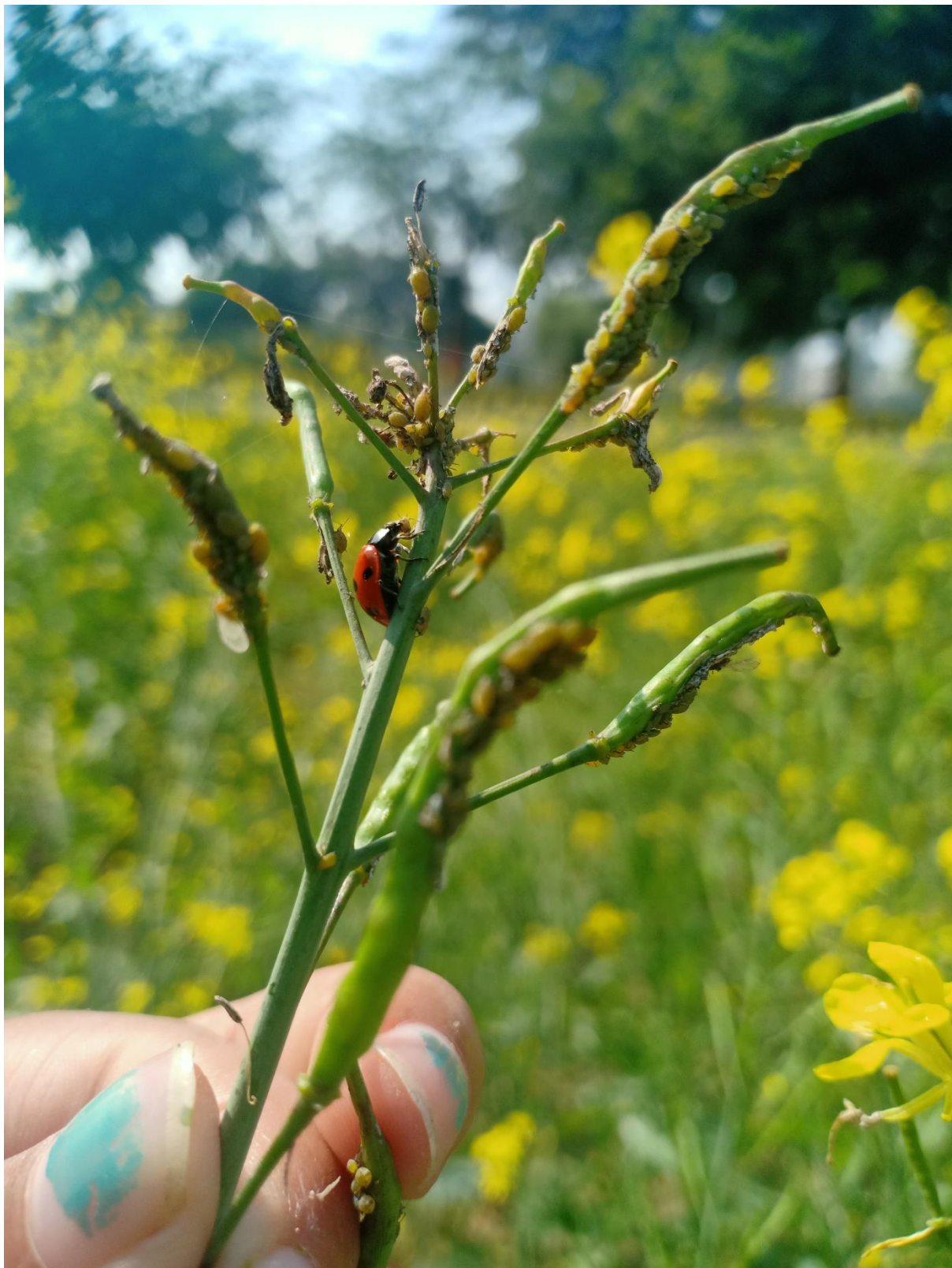
Fig 5: Control of mustard aphid through natural enemy ladybird beetle.