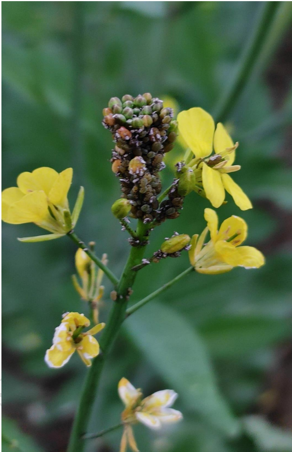
Fig 2: Aphid infested plant of mustard