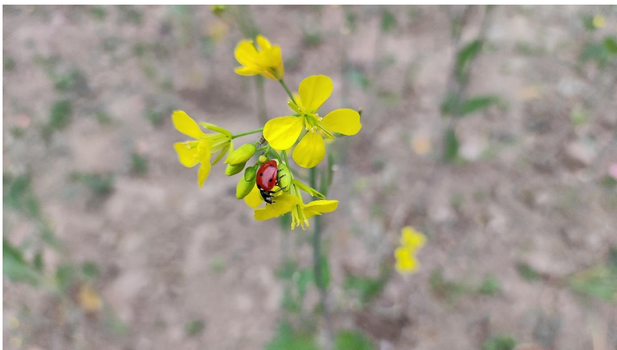
Fig 4: Adult lady bird beetle feeding on aphids.