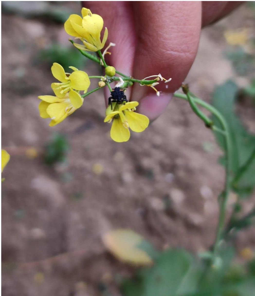
Fig 3: Grub of lady bird beetle Coccinella septempunctata feeding on aphids.