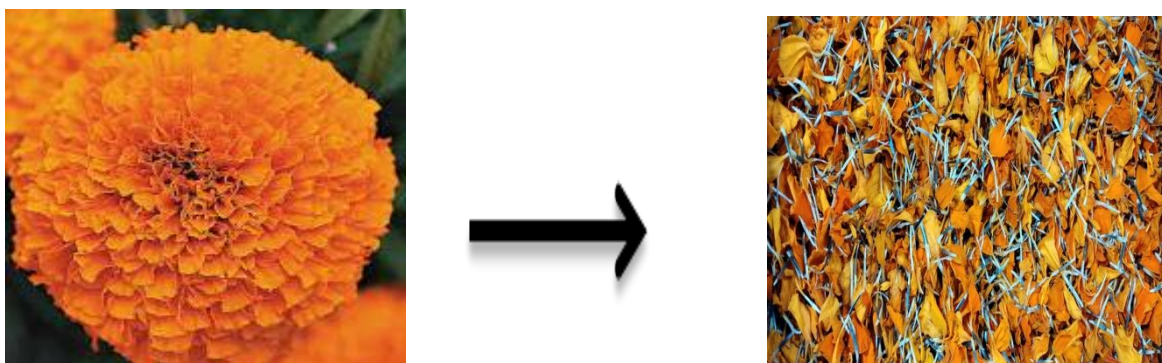
Fig. 1: Marigold flower ( Tagetes erecta ) from temple and its petals.