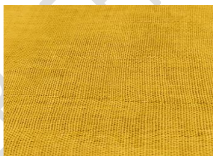
Fig. 2: Silk cloth dyed with Marigold flower ( Tagetes erecta ) from temple.

The analysis, of the dye of Marigold flower using high-performance liquid chromatography coupled to a DAD detector (HPLC–DAD), enabled the identification and quantification of lutein labelled as ‘A’ (3R, 3’R, 6’R-βε-carotene-3,3’-diol) in Figure 2 and is classified as a xanthophyll pigment, belonging to the category of oxycarotenoids at retention time of 2.033 previously reported in marigold flower (19) with an area percentage of 53%.