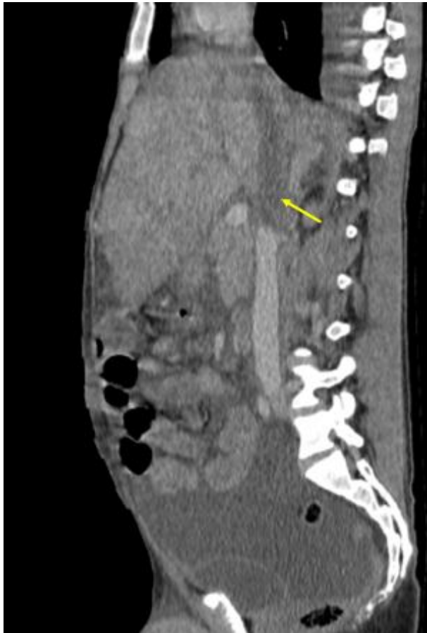
Figure 3: Thrombosis of the Inferior Vena Cava (IVC)