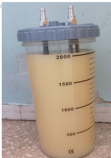
Figure 2 : Ascitic Fluid