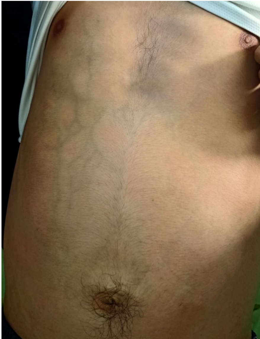
Figure 1 : Collateral Thoracic Venous Circulation