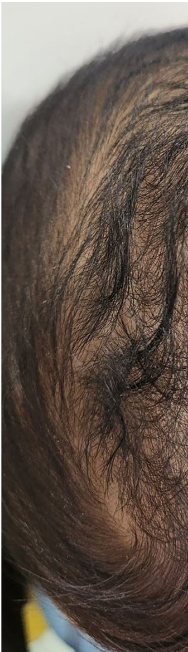
Figure 3: Clinical image showing sparse and thin hair on the scalp

On trichoscopy, the hairs were widely spaced and there was a single hair per orifice, there were also some hair casts and perifollicular scale, but there was no hair thickness heterogeneity, no yellow dots, no perifollicular discoloration, no honeycomb pigmentation and no elongated linear blood vessels. (figure 4)