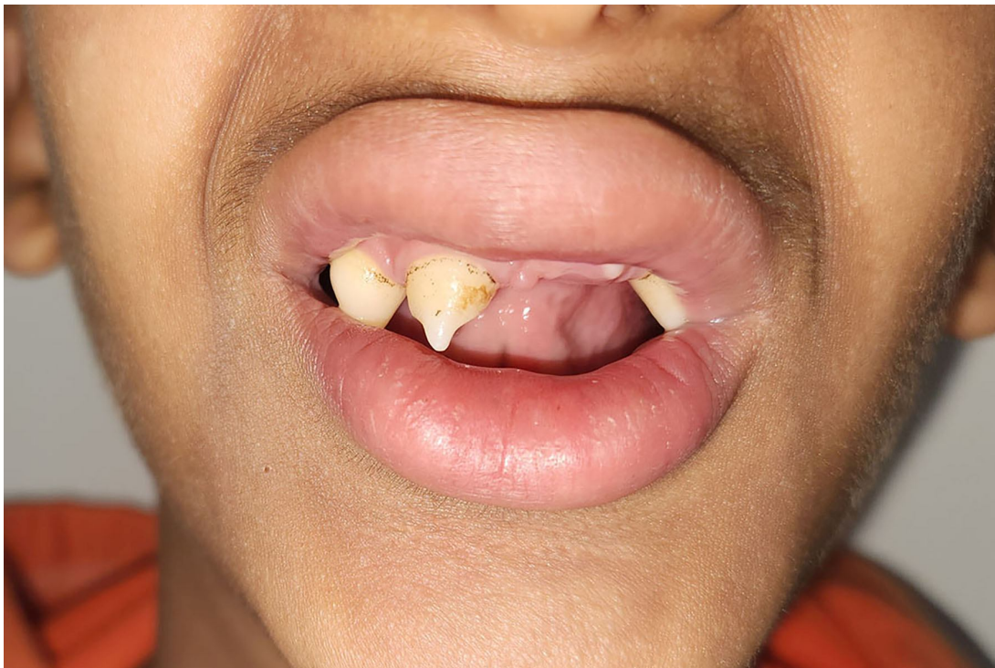
Figure 2: Two conical incisors and one conical canine

There was retraction of the anterior hairline, with short, scattered and thin hair on the scalp (figure 3) and eyebrows.