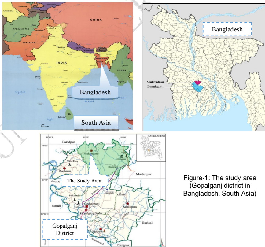
Figure-1: The study area (Gopalganj district in Bangladesh, South Asia)

Comment [H4]: The method has been explained in a coherent and quite complete manner but the method of sample selection has not been explained. It is also necessary to add how the validity and reliability of the instrument are. The type of statistical test needs to be clarified.