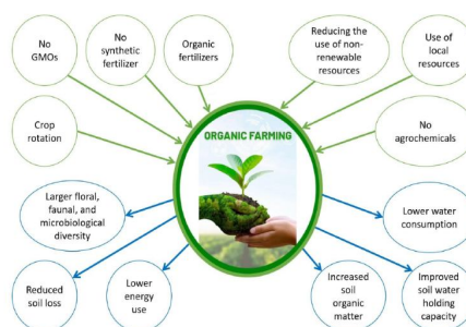
Fig .3 Organic Farming

Organic farming practices eschew synthetic chemicals in favor of organic manures and bio-pesticides. [9] This approach is particularly suited to MAPs, which are often marketed as natural or organic products. Farmers in Himachal Pradesh and Uttarakhand are increasingly adopting organic farming methods for cultivating crops like Withania somnifera (Ashwagandha) and Curcuma longa (Turmeric), ensuring that the final products meet organic certification standards.