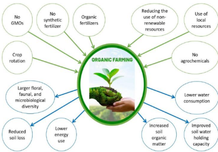
Fig .3 Organic Farming

Organic farming practices eschew synthetic chemicals in favor of organic manures and bio-pesticides. [9] This approach is particularly suited to MAPs, which are often marketed as natural or organic products. Farmers in Himachal Pradesh and Uttarakhand are increasingly adopting organic farming methods for cultivating crops like Withania somnifera (Ashwagandha) and Curcuma longa (Turmeric), ensuring that the final products meet organic certification standards.