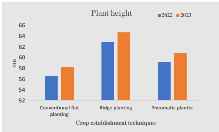
Fig 1. Effect of different crop establishment methods on plant height of maize at 30 DAS