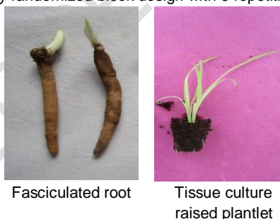
Figure 2: Planting materials used in the experiment