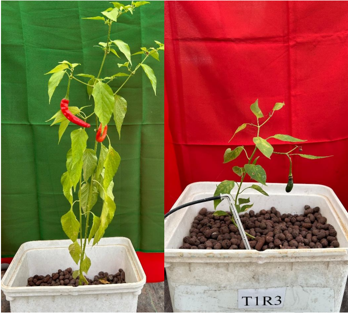
Fig.3.Surface sterilized apparently healthy seed sample and naturally infected seed sample at harvest