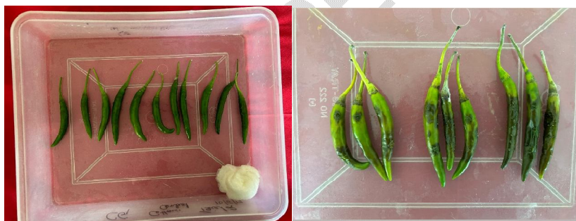
Fig. 1. Artificially inoculating fruit sample with Colletotrichum capsici

For inoculation, pinprick method on chilli fruit given by Naik and Rawal (2002) was followed. Seven days old cultures were used for artificial inoculation. Red chilli fruits of OLA-1 variety harvested were surface sterilized with one per cent sodium hypochlorite solution and then washed in two changes of sterile water. Thereafter, the fruits were pricked with pin bundles specially designed for pricking. The pinpricked fruits were then dipped in spore suspension having 1 \times 10^8 spores/ml for one minute. Further these fruits were kept for incubation on a perforated tray under humid chamber. The humid chamber was prepared by keeping water in the tray, which was placed below the perforated tray kept with inoculated fruits. Three wet cotton pieces were placed on the tray. The tray was covered with polythene sheet to maintain the relative humidity of over 90 per cent and then incubated at 25^\circ \pm 1^\circ\text{C} for eight days. After the development of symptom on the chilli fruits, reisolation of the fungus was made from the affected portion of the fruit as per the method described earlier and Koch's postulates were proved. Then the seeds were extracted from fruits and kept on PDA for reisolation of pathogen for confirmation (Fig. 1 & 2).