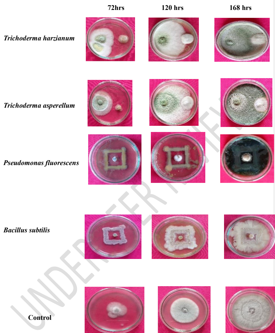
Plate 1 : Evaluation of potential bio-control for their effect against Cercospora sp.