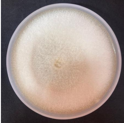
Fig 1 : Axenic culture of Fusarium incarnatum isolates.