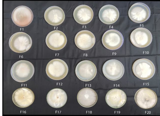
Fig 2: Mycelial growth of twenty Fusarium sp.