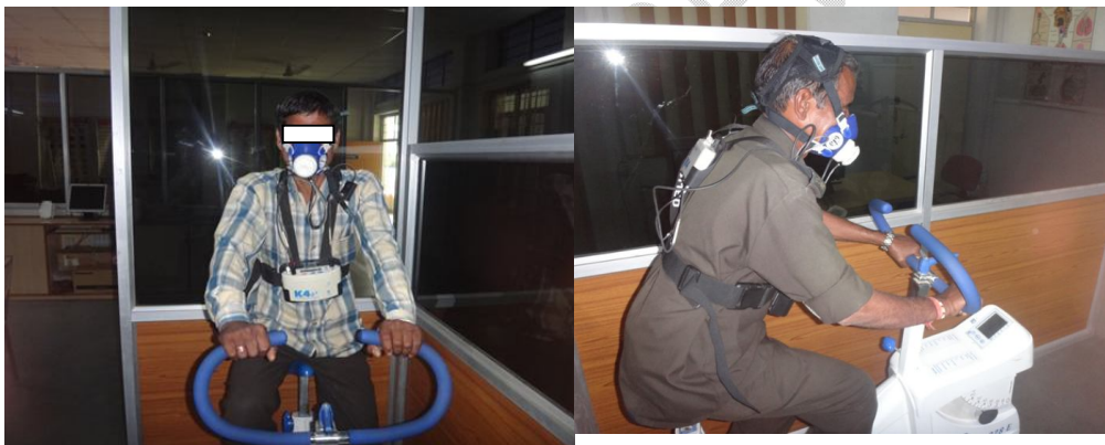
Fig 1: Physiological cost estimation of male agricultural workers

and oxygen consumption rate had been reported at saddle height of 100% of trochanteric height (Nordeen- Snyder, 1977; Price and Donne, 1997). Therefore, the saddle height for this experiment was set equal to the trochanteric height of the subject. The crank length was kept standard (178.5 mm) as supplied with the ergometer. After taking 5 min data of physiological responses during resting the subject was asked to start pedalling work on the bicycle ergometer at a pre-set pedalling rate. The metronome for pedalling rate was set as per the requirement for that trial. The subject was attend to monitor the desired pedalling rate according to the display on the ergometer. The workload was increasing the level required for the trial within first 30 second using the load increasing screw on the ergometer. The subject worked on the ergometer at the set pedalling rate and workload for duration of 15 min. At the end of 15 min trial he was asked to stop pedalling work, get down from the ergometer and have rest while sitting on a chair placed by the side of the ergometer.