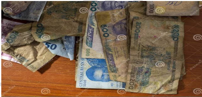
Fig 1: Nigerian currency notes

The selected antibiotics discs (Oxoid, UK) used for the study include meropenem (10 µg), nitrofurantoin (30 µg), cephalexin (30 µg), ciprofloxacin (10 µg), gentamicin (10µg), ofloxacin (5µg), clindamycin (10 µg), erythromycin (10µg), ceftriaxone (30µg), ampicillin (30µg), levofloxacin (5µg) amoxicillin (30µg), streptomycin (30µg), cloxacilline (10µg), perfloxacin (10µg), chloramphenicol (10µg).