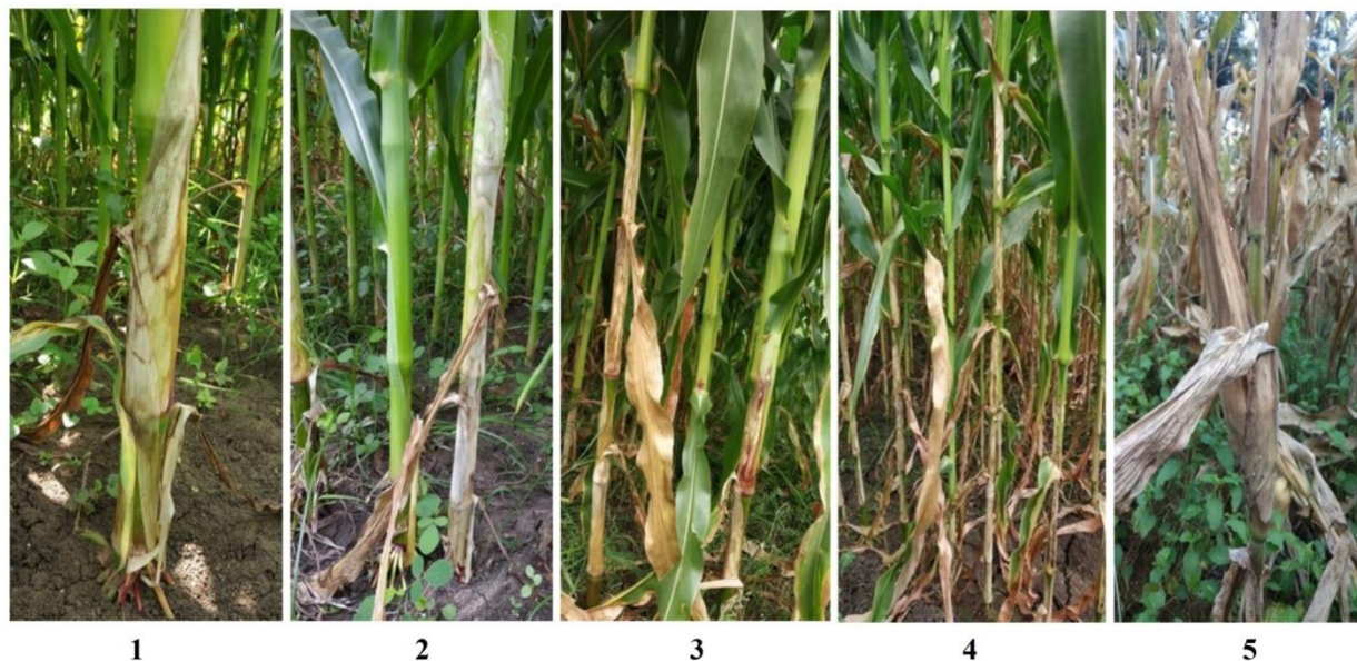
Plate 1. Pictorial representation of disease severity scale for maize BLSB

and no disease was recorded in Appikatla village. Highest PDI of 31.30 % was recorded in Peddakadubur village from Kurnool district and no disease was recorded in Chinnakadubur village.