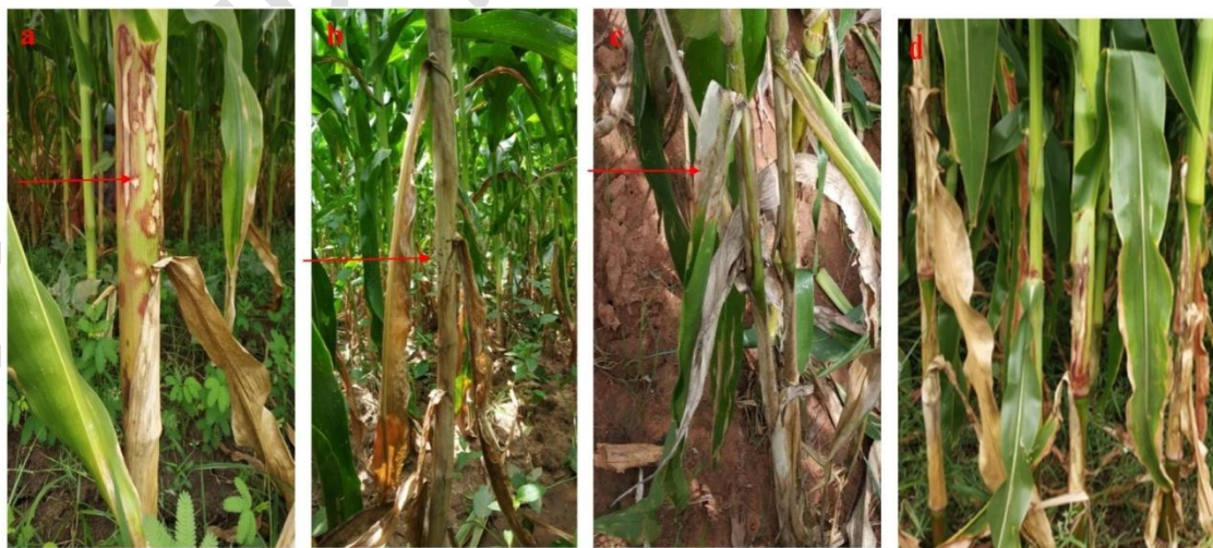
Plate 2. Symptoms of BLSB on maize under field conditions: a-Rind spotting; b-Sclerotial bodies on rind of stalk; c-BLSB symptoms on leaves; d-Different degrees of lesion development on rind of stalk

Banded leaf and sheath blight disease was initiated on 40 to 45 days old plants. Symptoms appeared on lower leaf sheaths as small water soaked, irregularly globular white lesions that extended to upper leaf sheaths as enlarged spots with irregular margins. Initially, spot colour varied from purple to brown tinge. They turned in to straw coloured necrotic patches giving banded appearance, which quickly spread to leaf blades and developed rapidly resulting in thin, papery leaf that resembled like snake skin casting. The pathogen caused damage to all the aerial parts except tassel (Plate 2 and 3).