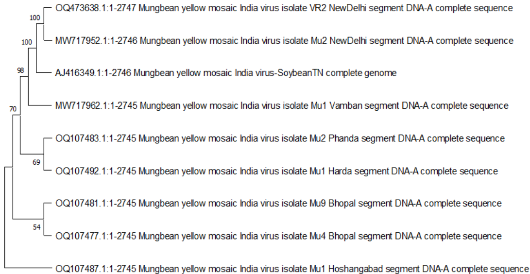
Fig.3: The evolutionary history was inferred by using the Maximum Likelihood method and Tamura-Nei model. The tree with the highest log likelihood (-4868.00) is shown. The percentage of trees in which the associated taxa clustered together is shown above the branches. Initial tree(s) for the heuristic search were obtained by applying the Neighbor-Joining method to a matrix of pairwise distances estimated using the Tamura-Nei model. This analysis involved 9 nucleotide sequences. Codon positions included were 1st+2nd+3rd+Noncoding. There were a total of 2747 positions in the final dataset. Evolutionary analyses were conducted in MEGA11.

study characterized the full genome sequence of begomovirus, which causes yellow mosaic disease of soybeans in the delhi region of India. MYMV is the most common isolate of yellow mosaic virus infecting mungbean in Western and Southern India, while MYMIV is more prevalent in India, Pakistan, Bangladesh, Nepal, and Vietnam (Malathi and John, 2009),