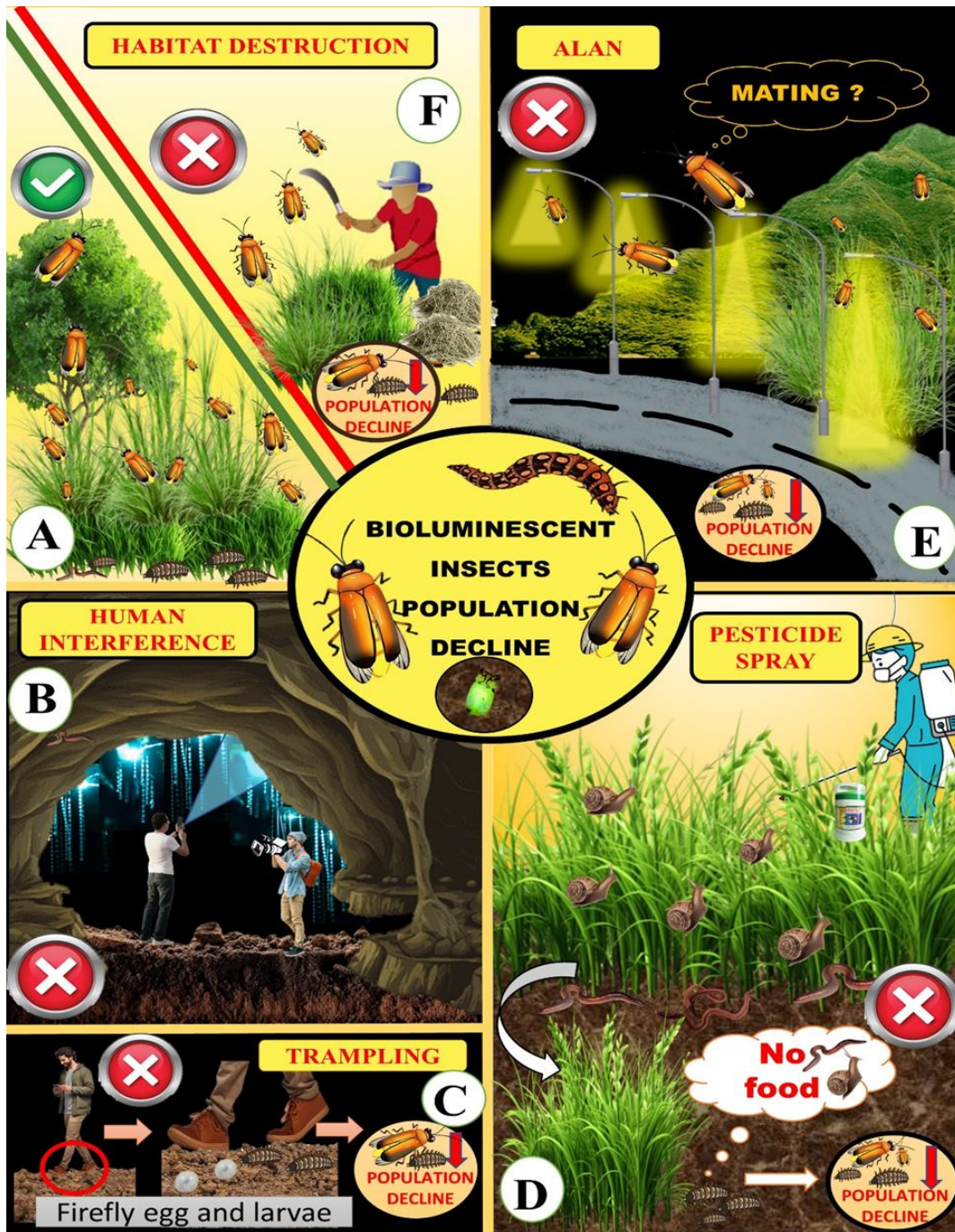
Fig. 2. Reasons for population decline of bioluminescent insects.

A. Natural habitat for bioluminescent insects: Negative impact of tourism on bioluminescent insects by B. light pollution, C. Trampling; D. Insecticide residues affecting the primary prey of bioluminescent insects; E. ALAN affects the mating of bioluminescent insects; F. Habitat destruction leading to population decline.