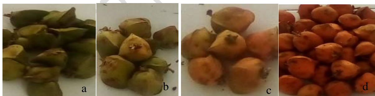
Figure 1 : Fruits of Pancovia laurentii at different stages of maturity: physiological maturity (a); veraison (b); taste prematurity (c); taste maturity (d)

These fruits are grouped in clusters (Figure. 1)