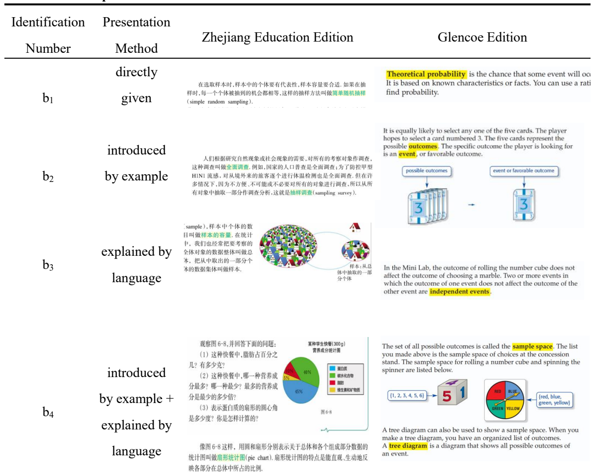
Table 3 Examples of Content Presentation Methods in Chinese and American Textbooks

Next, analyze all the knowledge points of "statistics and probability" in the two editions of textbooks, classify them according to the distribution of presentation methods, and the statistical results are shown in Table 4.