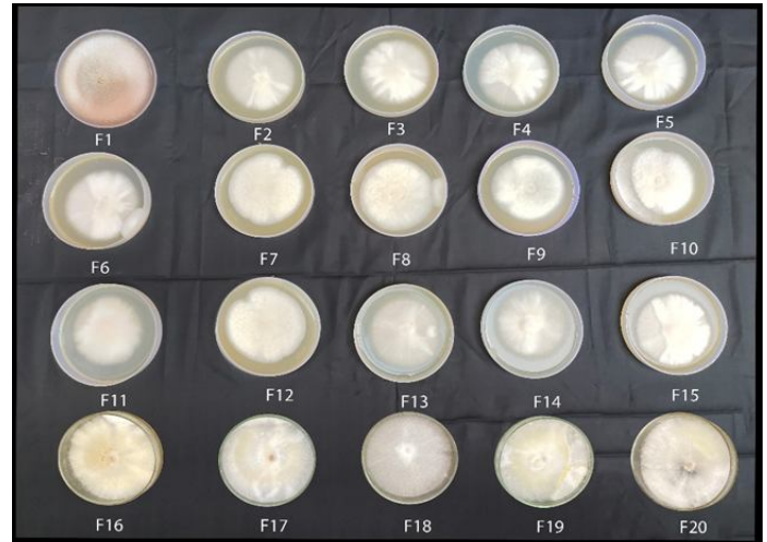
Fig 1 : Axenic culture of Fusarium incarnatum Fig 2: Mycelial growth of twenty Fusarium sp. isolates.