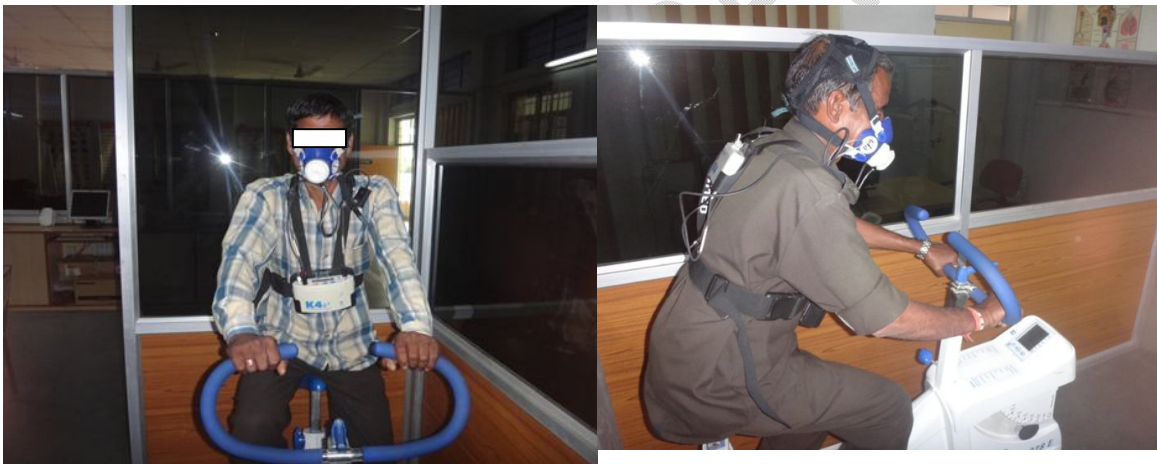
Fig 1: Physiological cost estimation of male agricultural workers

and oxygen consumption rate had been reported at saddle height of 100% of trochanteric height (Nordeen- Snyder, 1977; Price and Donne, 1997). Therefore, the saddle height for this experiment was set equal to the trochanteric height of the subject. The crank length was kept standard (178.5 mm) as supplied with the ergometer. After taking 5 min data of physiological responses during resting the subject was asked to start pedalling work on the bicycle ergometer at a pre-set pedalling rate. The metronome for pedalling rate was set as per the requirement for that trial. The subject was attend to monitor the desired pedalling rate according to the display on the ergometer. The workload was increasing the level required for the trial within first 30 second using the load increasing screw on the ergometer. The subject worked on the ergometer at the set pedalling rate and workload for duration of 15 min. At the end of 15 min trial he was asked to stop pedalling work, get down from the ergometer and have rest while sitting on a chair placed by the side of the ergometer.