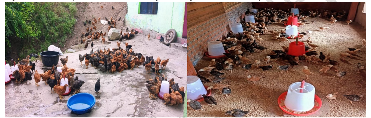
Figure 3. Backyard Poultry Farming in Ramban..Figure 4.Free Range Unit established under HADP Programme