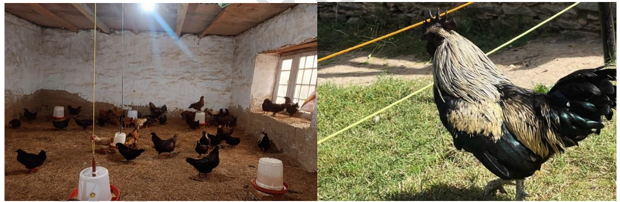
Figure 5.Free Range Unit established under HADP ProgrammeFigure 6.Kadaknath Chicken.